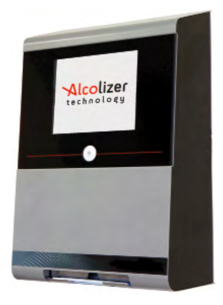
WALL MOUNT 4