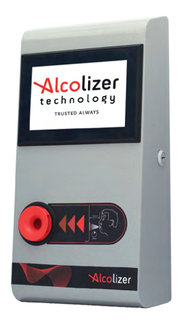
WALL MOUNT CENTURION